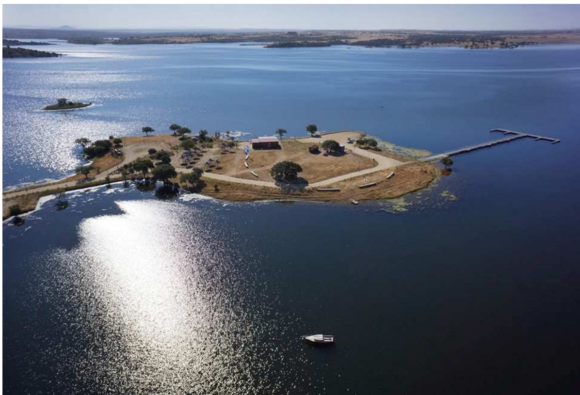
Race Office (Centro Náutico Reguengos de Monsaraz) and Camping area.